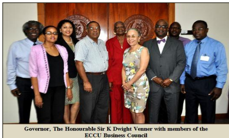
Governor, The Honourable Sir K Dwight Venner with members of the ECCU Business Council